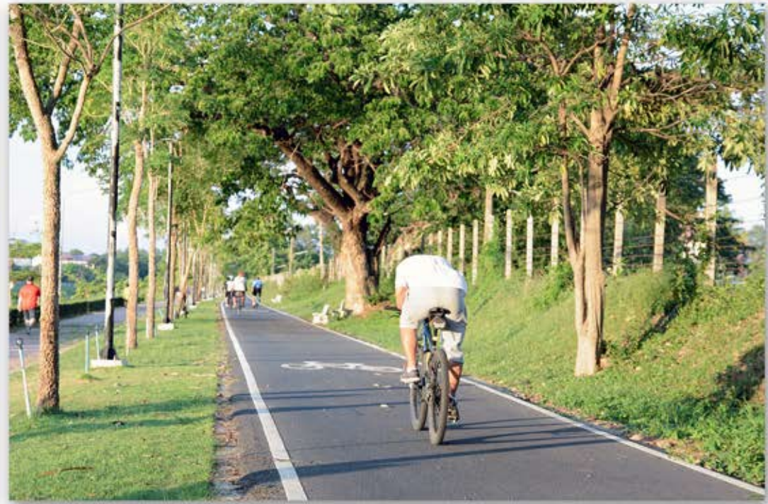
bicycle - jogging tracks