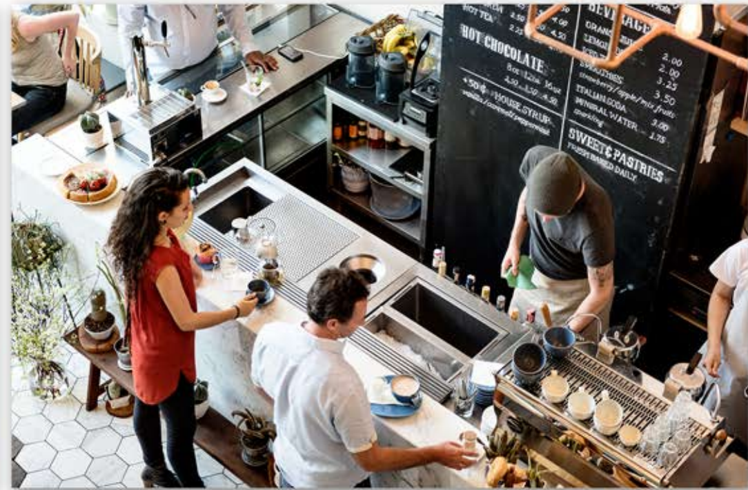
cafes - restaurants