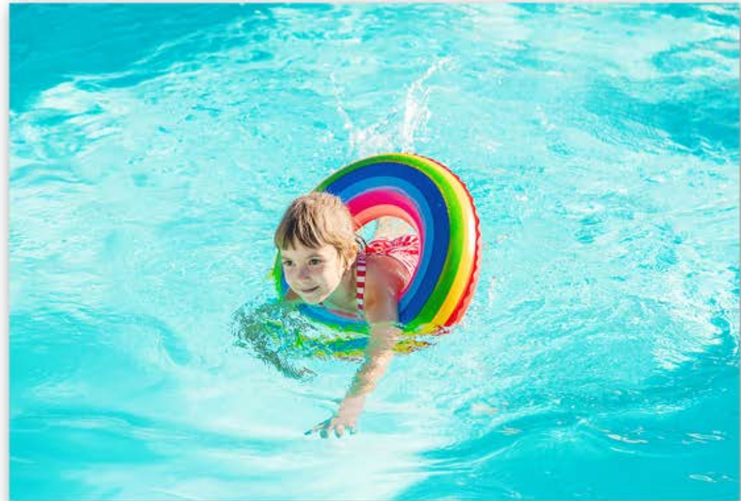
indoor - outdoor swimming pool